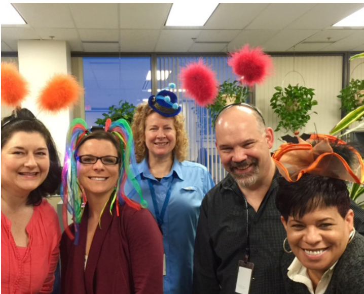
Photo: Silly Hat Halloween

Division of Personnel and Labor Relations Staff in Anchorage have fun on Halloween with some silly hats.